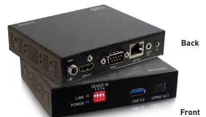
29976 HDMI over IP Decoder - 4K 60Hz