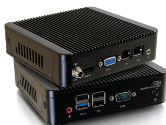
29977 Network Controller for HDMI over IP