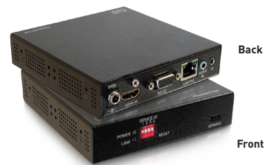
29975 HDMI over IP Encoder - 4K 30Hz